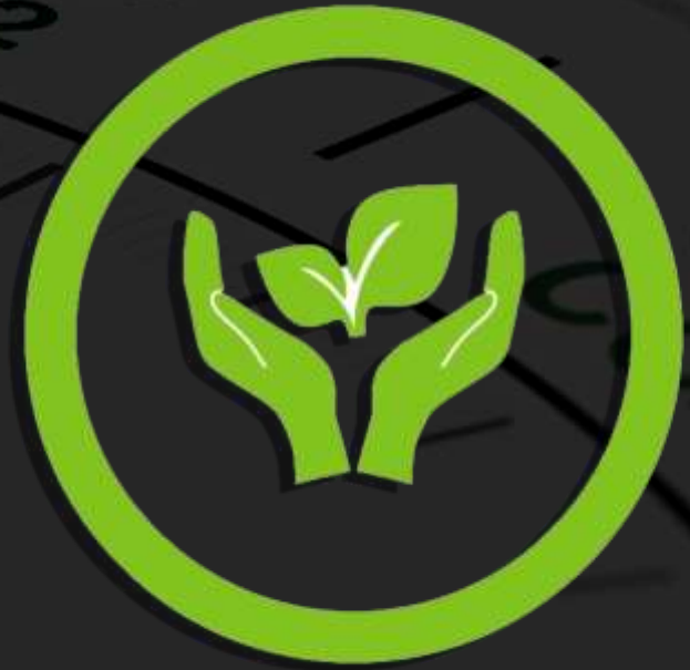
Energy Conscious Organisations (EnCO)